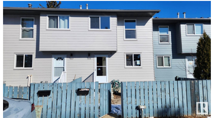
3115 144 Ave NW, Edmonton, AB

MLS® # E4429274 Price $165,000 Bedrooms 3 Bathrooms 2.50 Full Baths 2 Half Baths 1 Square Footage 1,051 Acres 0.00 Year Built 1978 Type Condo / Townhouse